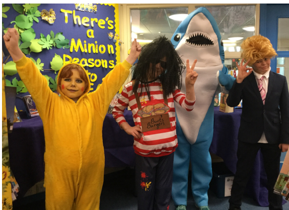
The winners in costume

The money we donated went to schools in different countries to give them books and pens so that they can also have a good education.