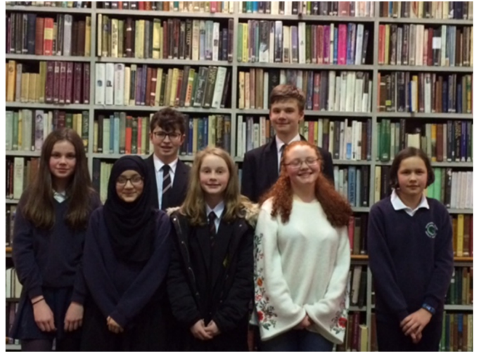
Proud Winners ...this photo also featured in the local newspaper